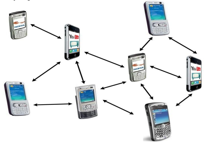
Fig. 1 Example of a typical Manet

MANET is used in applications such as search and rescue, automated battlefields, emergency relief scenarios, law enforcement, public meeting, data network, device network, virtual classroom, disaster recovery, sensor networks and other security sensitive computing environment.